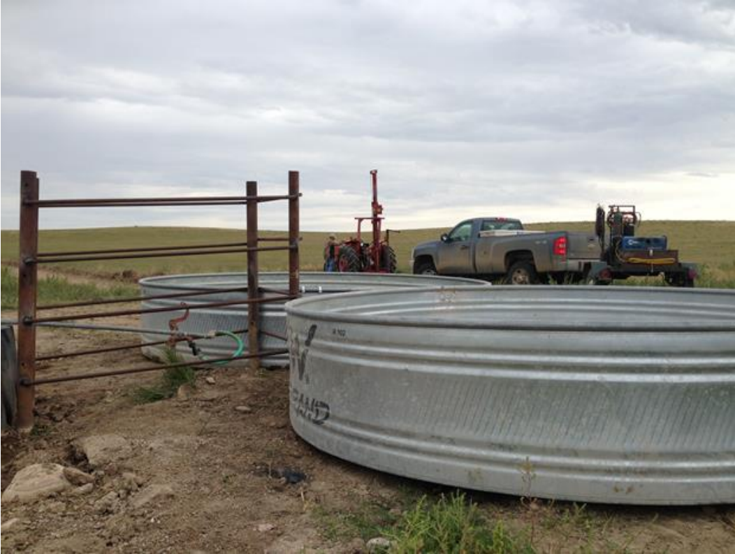
The CPER crew finishing repairs and installation of two new water tanks in the Crossroads pasture.

http://www.ars.usda.gov/Main/docs.htm?docid=24218 . Remember to send your questions, concerns, and ideas my way and I do my best to have them addressed in next week's email.