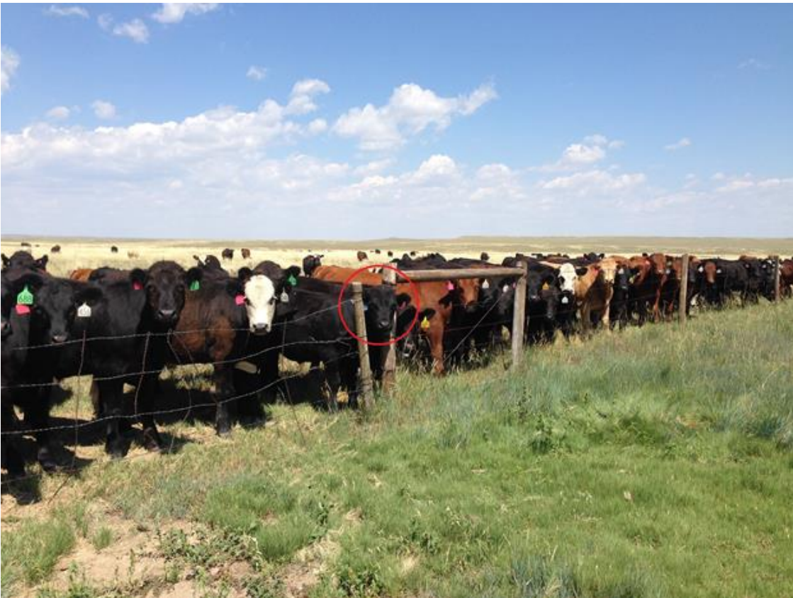
Attempted escape: If you've ever wondered how gates get rubbed open...